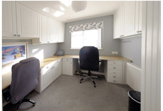
Bedroom 3 / Office 8'0" x 8'9" (2.44 x 2.67)