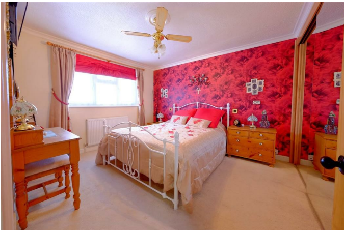
Bedroom 1 10'0" x 11'3" (3.05 x 3.45)