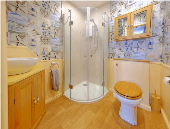
Shower Room 8'0" x 6'5" (2.45 x 1.97)