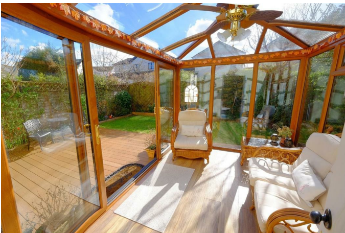
Conservatory 11'5" x 7'8" (3.5 x 2.34)