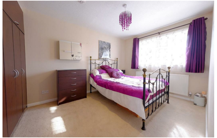
Bedroom 2 10'0" x 8'7" (3.05 x 2.63)